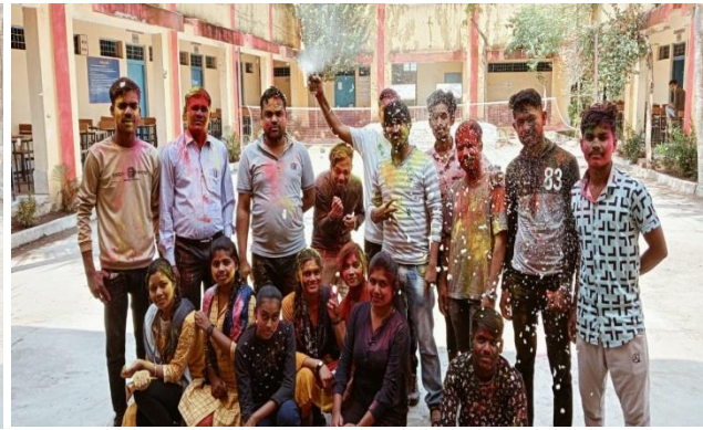
Pics:-celebrating a Holi event in institution & enjoyment of students during this day.