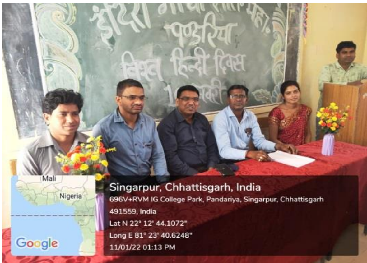
Pics:- Organizing a lecture on “world Hindi day” in institute